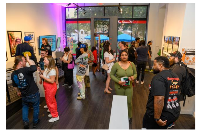
Above: Can't Stop, Won't Stop: Celebrating 50 Years of Hip Hop

What the numbers don't tell us is that ACG is committed to increasing access and supporting the Region's diverse community to provide equitable experiences for all artists and art lovers! The fact remains this work is only possible because it is wholly supported by you and the funds we receive. Without your contributions, Albany Center Gallery cannot sustain its impactful programming and redistribute funds to local artists for their time and talent.