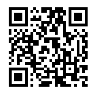
Scan this QR code with your phone camera to donate online!

We're endlessly grateful to you for supporting ACG and the creative economy, while prioritizing local and regional artists. You are our community. If you've experienced any programs or exhibits over the year, thank you for participating and please consider contributing to this appeal and/or inviting a friend to. Thanks in advance for your generosity in celebrating , valuing , sustaining , and funding More Art Everywhere!